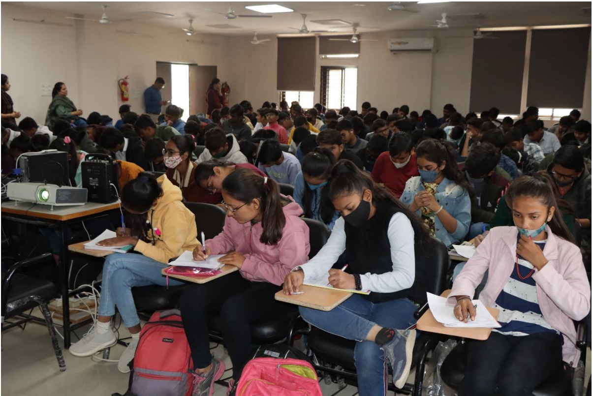
practical session on "Problem Statement & Solution"